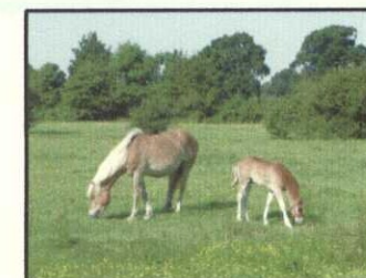
Typical views along the village walk