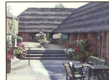
Jinney Ring Craft Centre