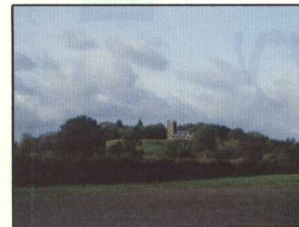
View of Hanbury Church

which is a good picnic spot and also serves food and drink.